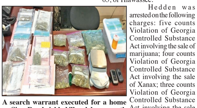
on Sims Road yielded illegal drugs worth Act involving the sale over $7,000 in street value, according to of metha-mphetamine; one count Violation of the Towns County Sheriff's Office.

a search warrant at a residence located off Sims Road in Hiawassee